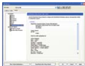
Select output for SharePoint 2007 or 2010.

types. Easily standardize configurations across multiple users to eliminate concerns about processing or capturing the right data to feed a process.