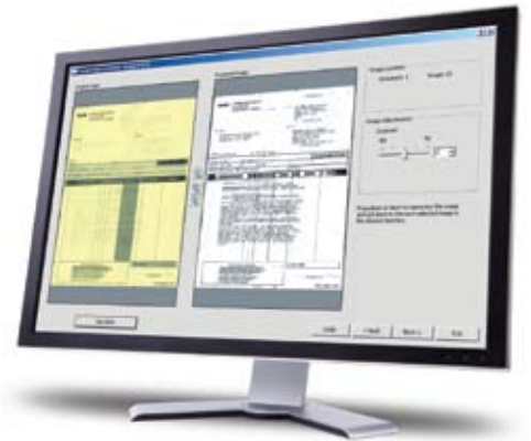
See images before and after correction for streamlined quality control.