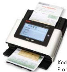
Kodak Scan Station Pro 550