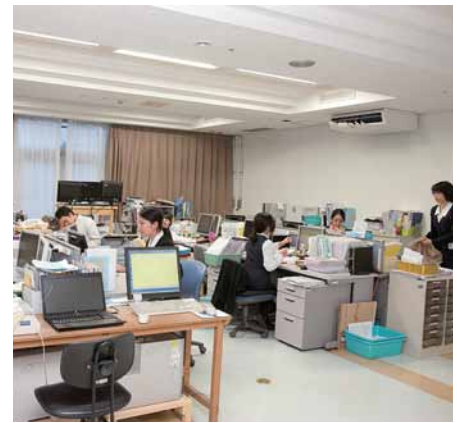
The Medical Examination Information Management Section's offices