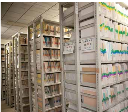
The dedicated repository where the hospital stores 15 years' worth of paper-based medical records

The document separation functions of the Kodak Capture Pro Software scanning software also rated highly. This scans bar codes printed on forms and automatically separates and stores the text as individual files. The hospital prints a barcode recording the patient ID and date of admission on the cover of its medical records, allowing all the pages to be stored as a single file. This means that even if a number of records are placed in the ADF and scanned together, the records can be separated and stored individually, considerably increasing the efficiency of the process. The file name and the