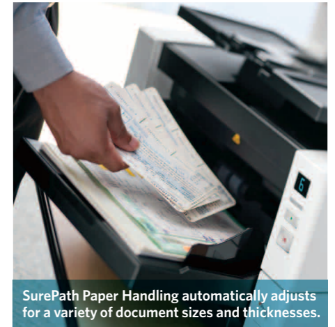
SurePath Paper Handling automatically adjusts for a variety of document sizes and thicknesses.

Optional A3 and A4 "tethered" flatbeds for added capability to scan odd-size, delicate or irreplaceable documents.