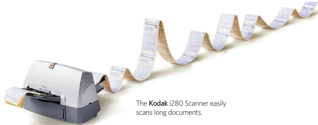
The Kodak i280 Scanner easily scans long documents.