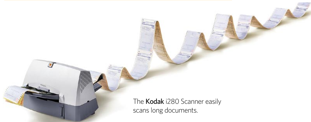
The Kodak i280 Scanner easily scans long documents.